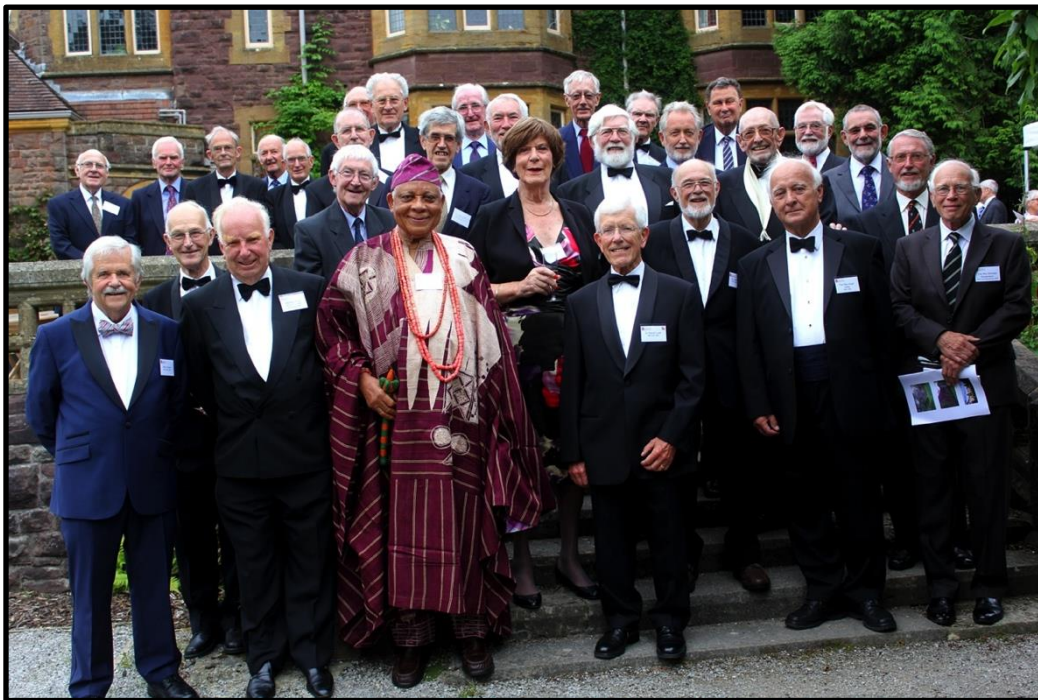
Founder Members present at the 60 th Anniversary Dinner (version with names available on request)